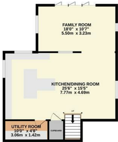
SECOND LOWER GROUND FLOOR